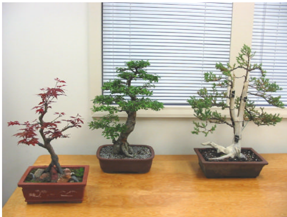
Trees at the meeting's show table.