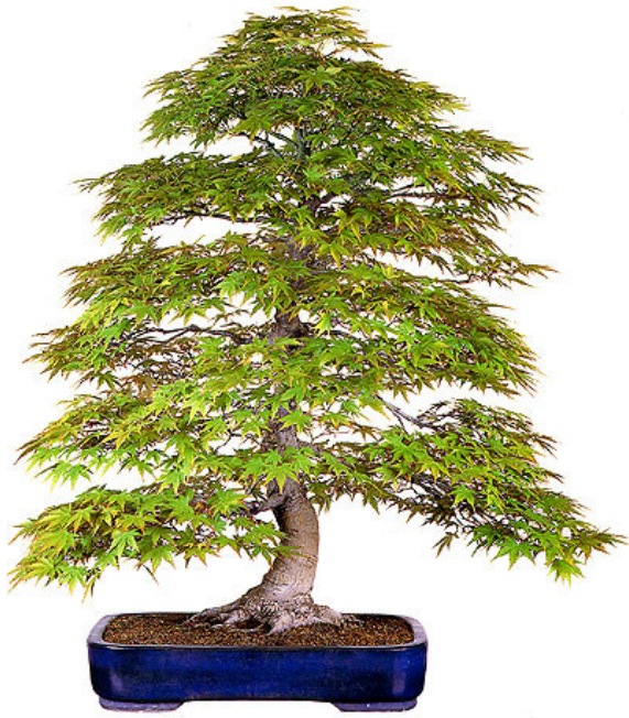
Acer palmatum - Japanese Maple