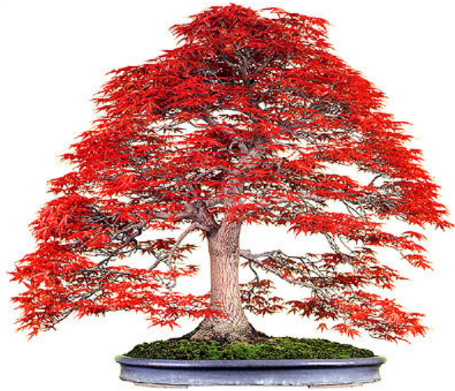
Acer palmatum - Japanese Maple