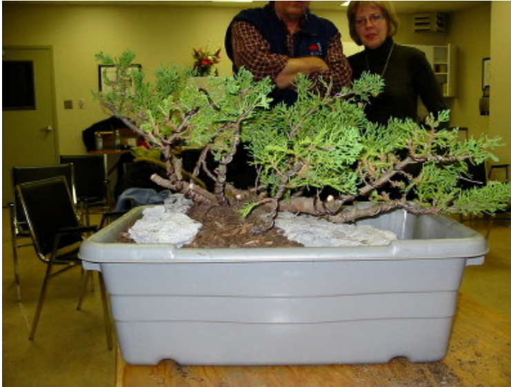
The raft style tree